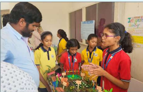
Science Exhibition at OAV- Hatiota