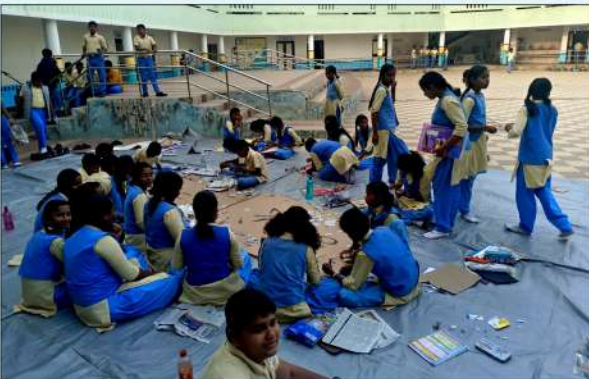
Mask Making workshop at OAV- Tingiria, Raruan, Mayurbhanj