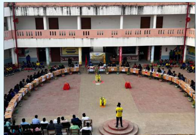
UN Muck Parliament, Odisha Adarsha Vidyalaya Jokidola, Banki, Cuttack