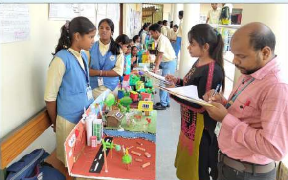
Science Exhibition at OAV, Smakhunta, Mayurbhanj