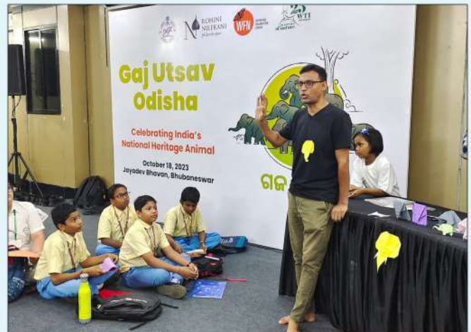
Students of OAV Ramdaspur Baranga participating in Gaj Mahotsav, Bhubaneswar

A few students in this world have managed to rise above the daily rut that is unique life, and he had managed to distinguish himself as exemplary student. All stakeholders of OAVS Family with heavy hearts stand in solidarity and pray the Almighty give the bereaved family the strength to withstand this tragic moment. May his soul find comfort in his new abode. "You will always be, treasured forever in our memory. We keep in our heart the love of the past, for there it was planted forever to last. Your presence will be missed, remembering you always, forgetting you never."